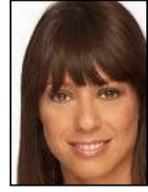
Gloria De Piero

Labour MP for Walthamstow Shadow Minister for the Home Office