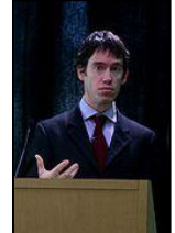
Rory Stewart OBE

Conservative MP for Skipton & Ripon PPS to Alan Duncan, Minister of State, DfID